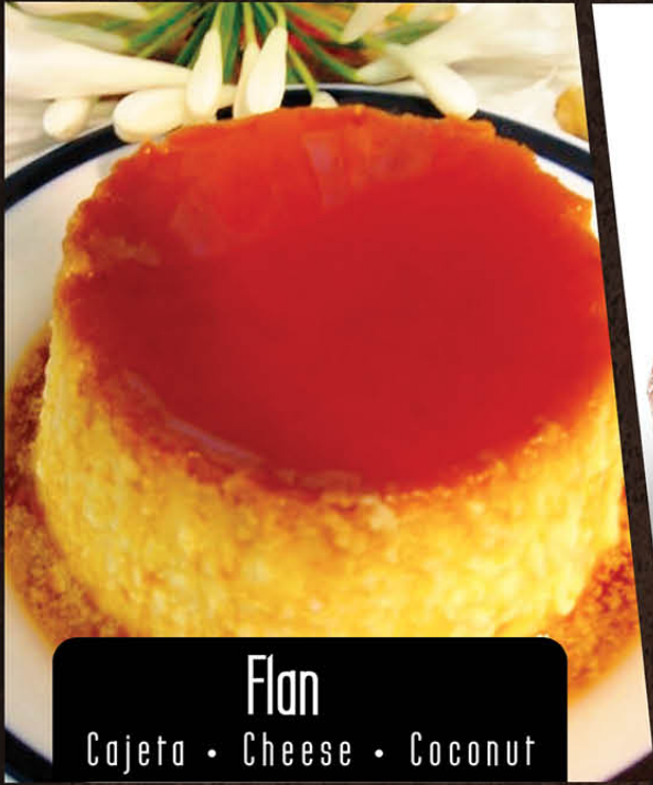
Flan Cajeta • Cheese • Coconut