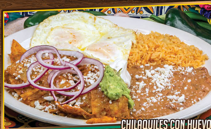
CHILAQUILES CON HUEVO