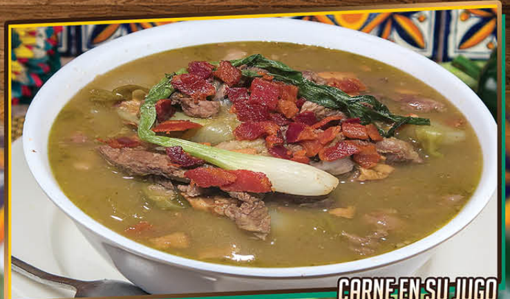
CARNE EN SU JUGO