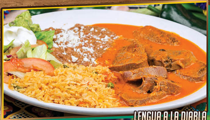
LENGUA A LA DIABLA