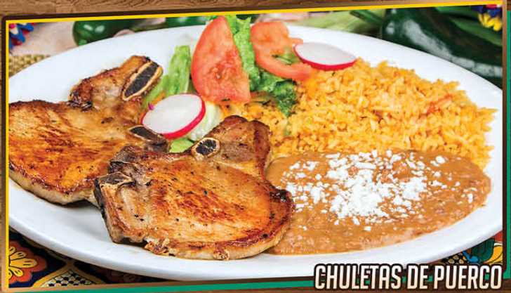
CHULETAS DE PUERCO