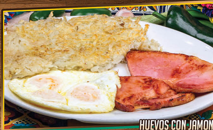
HUEVOS CON JAMON