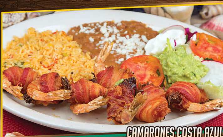
CAMARONES COSTA AZUL