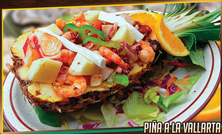
PIÑA A LA VALLARTA

WARNING: Eating raw Oysters and seafood may cause severe illness and even death in Persons who have liver disease (e.G. Alcohol Cirrhosis, cancer or others chronic illness that weakens the immune system. If you eat Oysters and become ill you should seek immediate medical attention. If you are unsure if you are at risk, you should consult your physician.