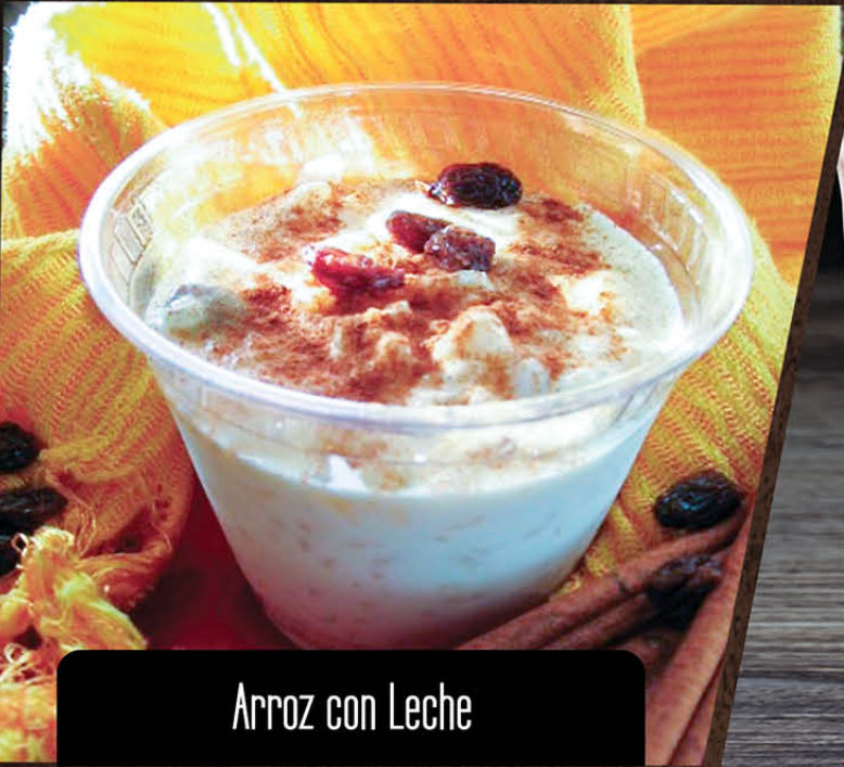
Arroz con Leche