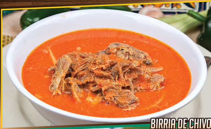
BIRRIA DE CHIVO