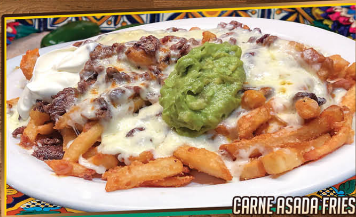
CARNE ASADA FRIES