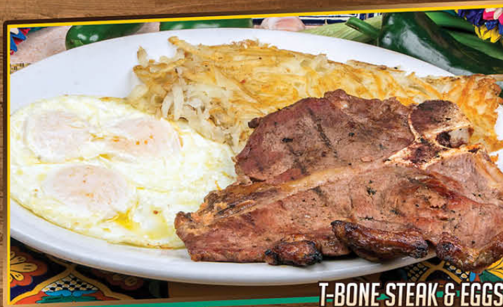
T-BONE STEAK & EGGS