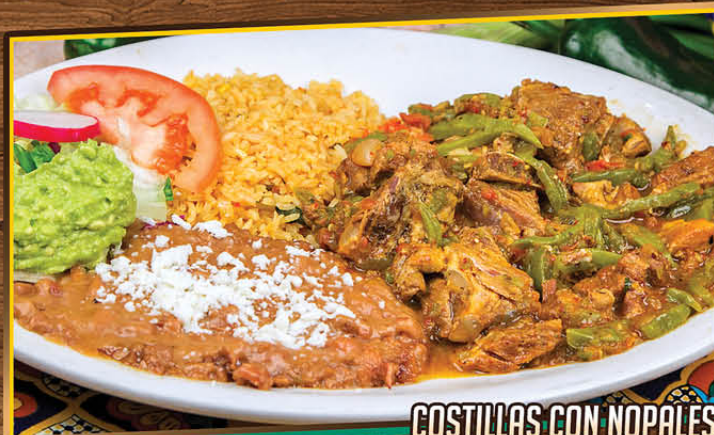
COSTILLAS CON NOPALES