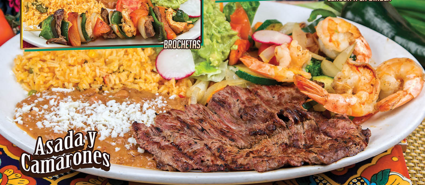
Asada y Camarones